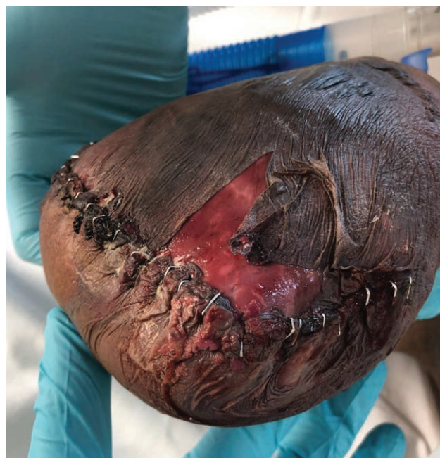
Fig. 1. Anterior skin flap necrosis developed 2 weeks after transhumeral amputation.

Surgeons may consider early hematologic consultation, a practice that has demonstrated improved outcomes in other patients at a high risk of perioperative thrombosis. 5