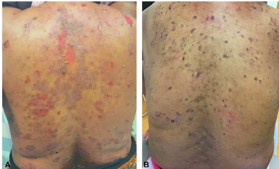
Fig 3. A , Pemphigus vulgaris. Deep erosions and crust involving the back. B , Pemphigus foliaceus. Superficial erosions with crust involving the back.