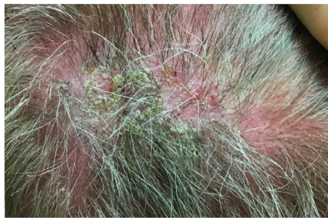
Fig 2. Pemphigus foliaceus. Thin plaques with cornflake scales and superficial erosions on the scalp.

and an additional cycle of rituximab (375 mg/m 2 weekly for 4 weeks).