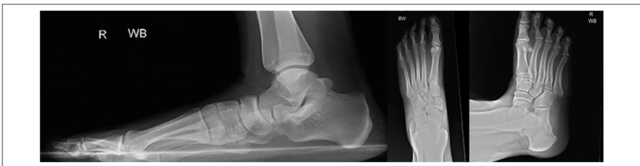
Figure 2. Preoperative lateral, anterior-posterior, and oblique weightbearing radiographs of the right foot.

eversion. At 10 weeks postoperatively, she had completed physical therapy and was asymptomatic.