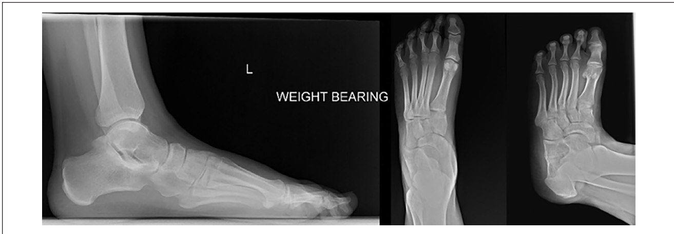
Figure 1. Preoperative lateral, anterior-posterior, and oblique weightbearing radiographs of the left foot.