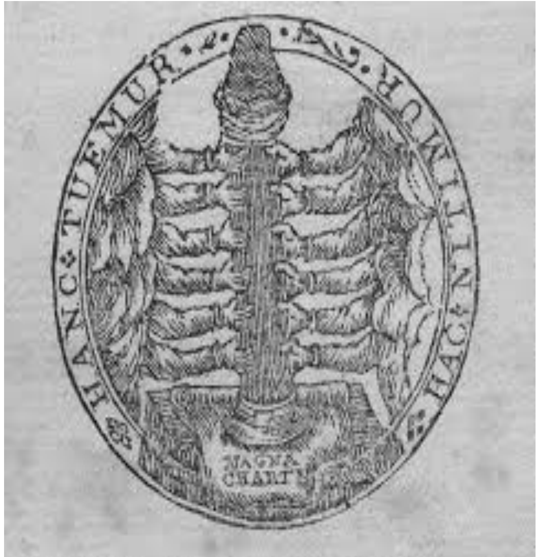
Figure 2: Engraving . This illustration depicts twelve hands, one for each colony represented in Congress. They are supporting a liberty pole crowned with a liberty cap. The pole rests on the perceived foundation of English liberty, Magna Carta. The text surrounding the engraving reads “ Hanc Tuemur, Hac Nitimur ,” the Latin motto, “This we defend, this we lean on.”